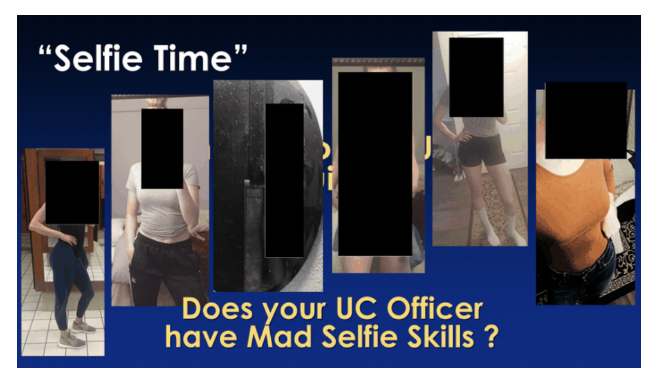
Vacaville Police Department, "Let's Make A UC Profile," 78 page 3

San Jose Police Department encourages undercover officers<sup>79</sup> to engage with suspects like pimps and those who may be paying for sex acts via the chat function on social media or on a dating website like Plenty of Fish and Grindr.