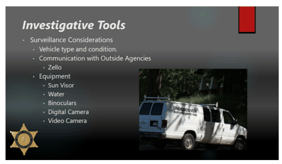
Riverside County Sheriff's Department, "Investigative Methods and Tools," page 4

In general, digital cameras are a common tool used by police in a wide variety of criminal investigations. For example, cameras are generally used to document crime scenes. This is also true for investigations targeting sex work. For example, in one presentation on "Investigative Methods and Tools," <sup>43</sup> the Riverside County Sheriff's Department lists both video and still cameras as equipment that should be used in surveillance operations and stakeouts (along with water and a sun visor).