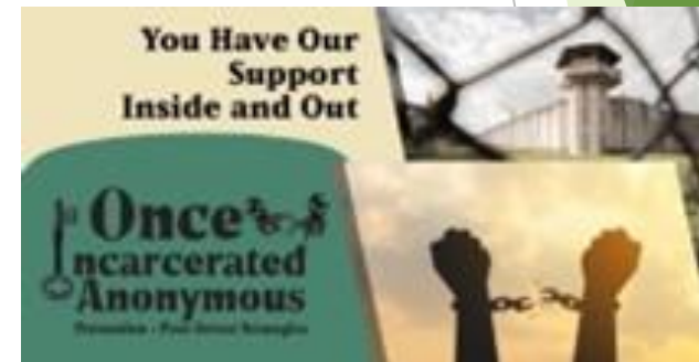
Program & Housing Navigator Once INCarcerated Anonymous