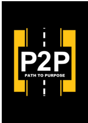
Transformative Coaching Path 2 Purpose